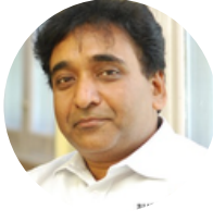
Rajesh Aggarwal IAS